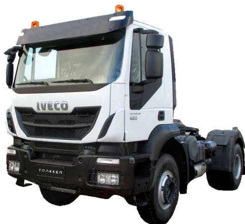
AD 400T38 TH 4x2